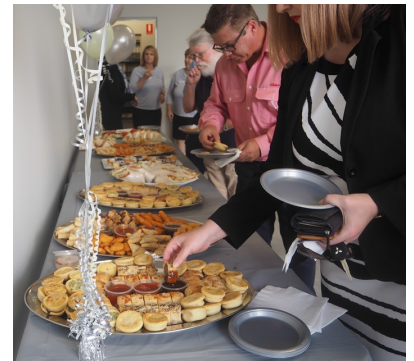
Guests enjoying some pastries & sandwiches